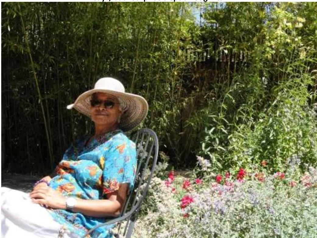
Walker at her country home in Northern California, where she has lived since the early 1980s. “What attracted me to this part of the world—Northern California—is really the resemblance to Georgia that it has,” she once told an interviewer. “This has been a very good place for me,” she went on, “a very good place for dreaming.”